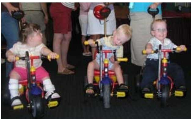
Children receive AmTrykes at the Swing for Kids Golf Outing.

The AmTryke program is designed to give children with disabilities their first set of wheels. We make AmTrykes available to kids that may have special challenges operating a regular tricycle. This unique therapeutic tricycle is hand and /or foot driven. It improves motor coordination, increases self-esteem, and is fun to ride!